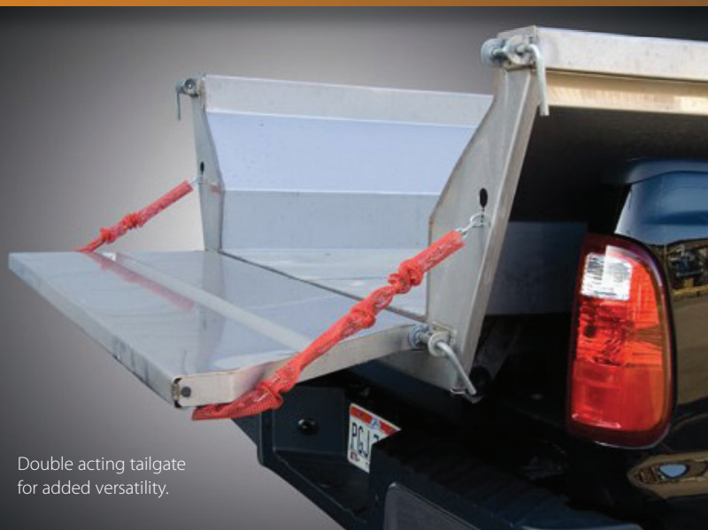
Double acting tailgate for added versatility.