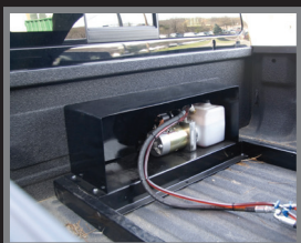
Battery and pump shield for added protection.