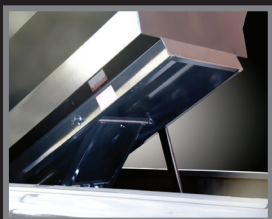
Self-locating underbody support.