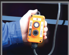
Hydraulic power unit controller.

*Never exceed the load capacity of your truck. Check your owners' manual.